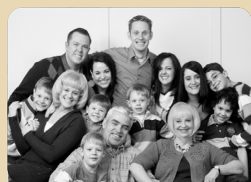
The Cooley Family 2011 Salt Lake City, UT