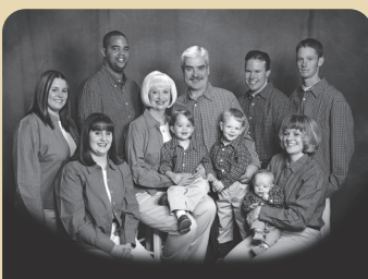
The Cooley Family 2002 Salt Lake City, UT