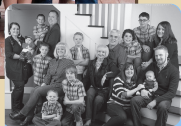
The Cooley Family 2014 Salt Lake City, UT