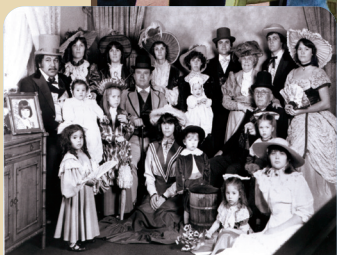
The Leatherby Family 1982 Sacramento, CA