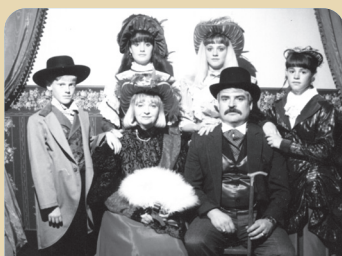
The Cooley Family 1990 Salt Lake City, UT